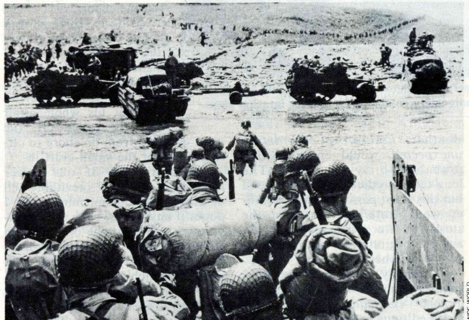
Long lines of U.S. soldiers (background) move inland on French coast in D-day assault as more men and supplies come ashore behind half-tracks.

"The final conference for determining the feasibility of attacking on June 5, was scheduled for 4:00 a.m. on June 4. . . . Some of the attacking contingents had already been ordered to sea. . . . On the morning of June 4 the report we received was discouraging. Low