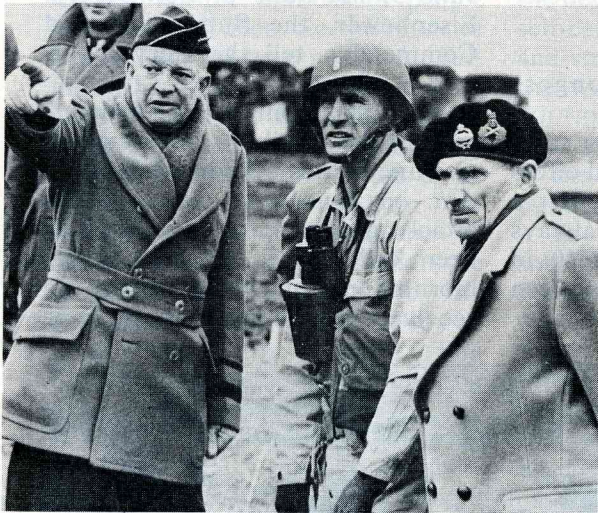
General Eisenhower and Britain's Field Marshal Montgomery confer on Normandy invasion plans.

“At three-thirty the next morning our little tent was shaking and shuddering under a wind of almost hurricane proportions. It seemed impossible that in such conditions there was any reason for even discussing the situation. Bad conditions predicted the day before for the coast of France were actually prevailing there and if we had persisted in the attempt to land on June 5 a major disaster would almost surely have resulted. This [the Meteorologic Staff] told us to inspire more confidence in their next astonishing declaration, which was that by the following morning [June 6] a period of relatively good