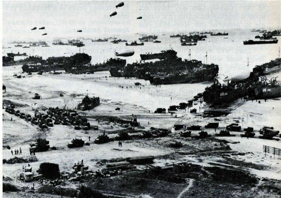
This photo was taken shortly after D-day from hillside overlooking French invasion beach. Barrage balloons fly overhead in case of air attack.

Field Marshal Bernard Montgomery felt compelled to say: “Such an historic march of events can seldom have taken place in such a short space of time. . . . Let us say to each other, ‘This was the Lord’s doing, and it is marvellous in our eyes.’”