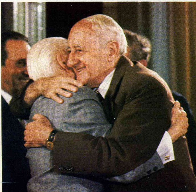
WARM EMBRACE is shared by Herbert W. Armstrong and longtime Israeli Minister of Tourism Moshe Kol.

The third event I wish here to recount was my meeting with Prime Minister Golda Meir, following those four wars, the fourth of which was the Yom Kippur or October war of 1973. I had been making frequent visits to Israel since the fall of